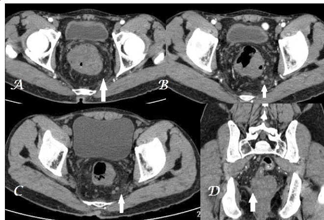
Figure 2 A-D Postcontrast transaxial CT images (A, B, C) of the same patient as in Figure-1 fail to show mesorectal nodes (white arrows) but involvement as noted on MRI. Also the levator ani involvement on right side (coronal MPR postcontrast CT image - D) is less distinct than on MRI in Figure 1.

For distant spread, MRI has limited role in detecting pulmonary parenchymal metastases less than 10 mm in diameter where CT scores over MRI. Role of MRI in detecting distant spread in cases of rectal cancer is reserved as a problem solving tool in